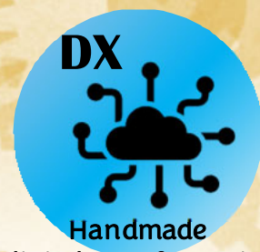
Handmade digital transformation